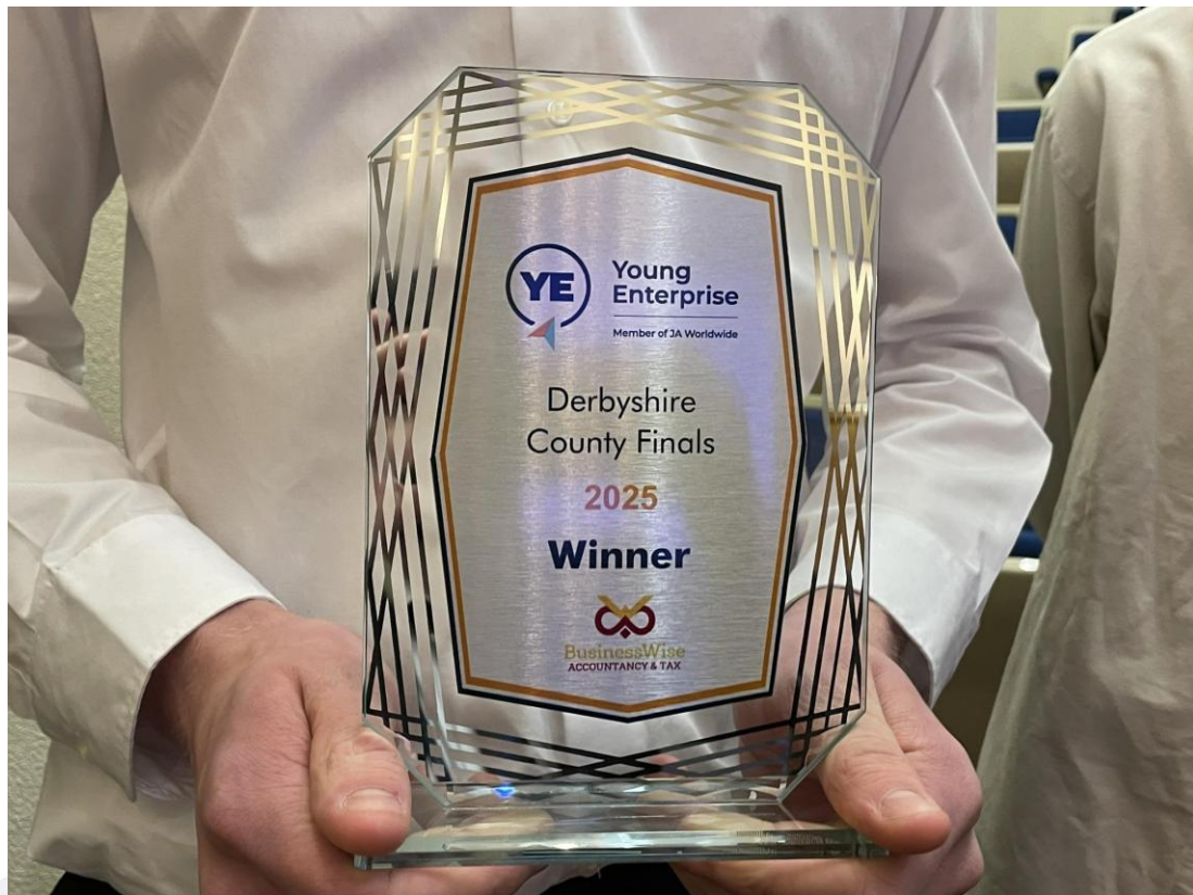
A close up of the award. A first for Belper School!