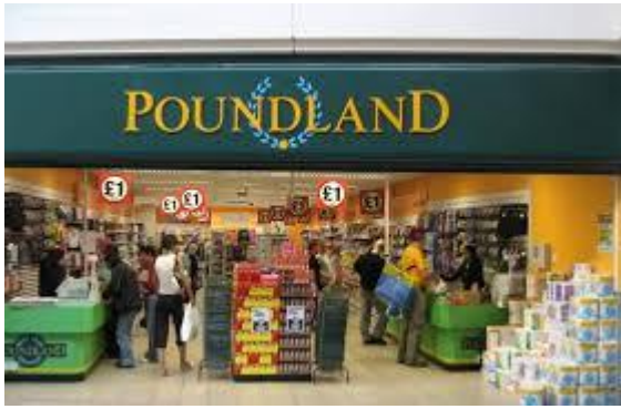
The first Poundland store in The Octagon Centre, Burton-Upon-Trent