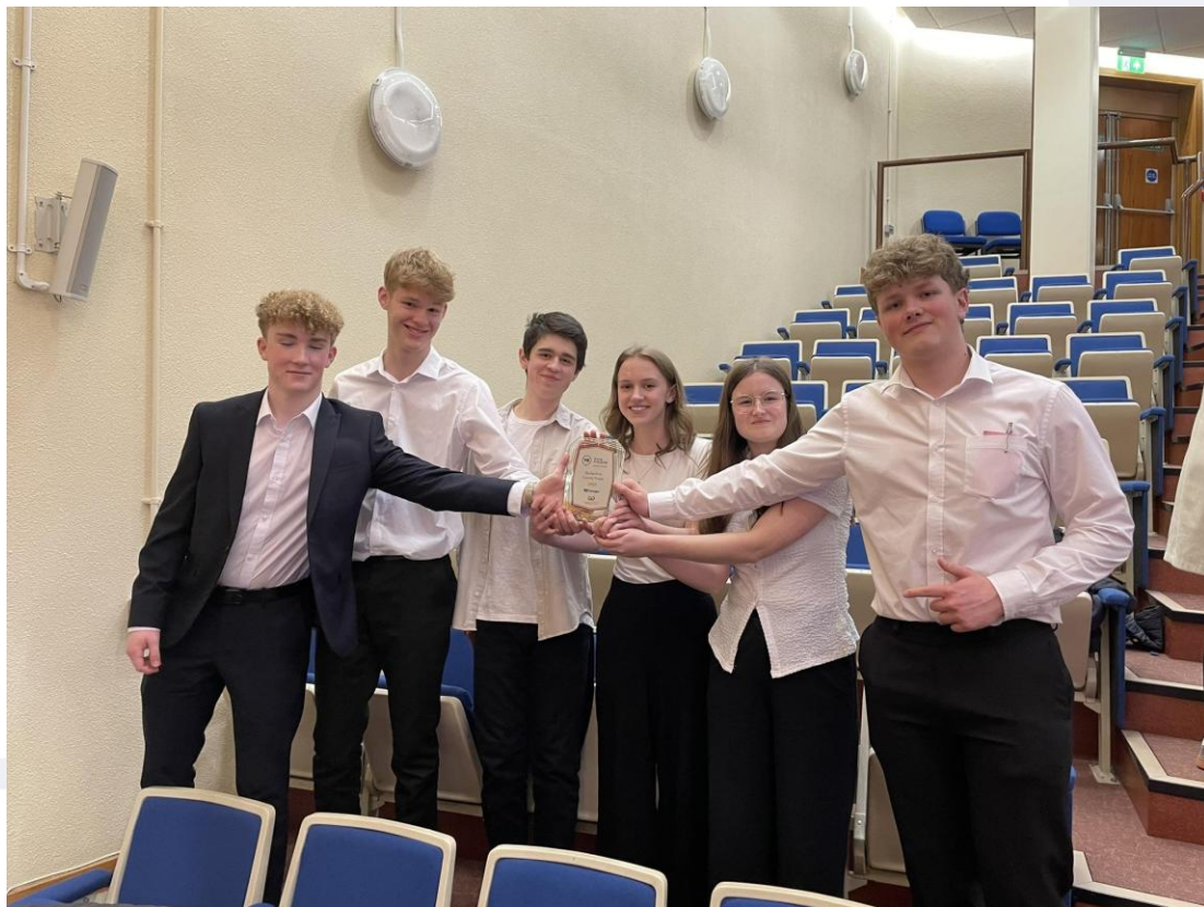
The successful winning team with the Derbyshire County Winners award