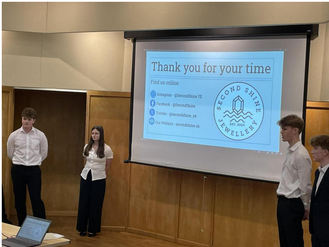
Second Shine presenting their product to the audience in Chesterfield