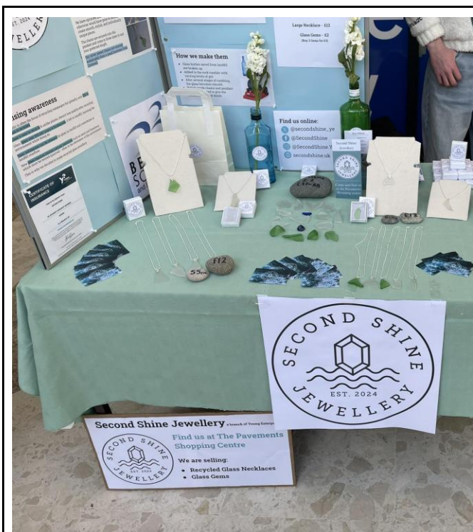
All Second Shine's Trade Display Stand