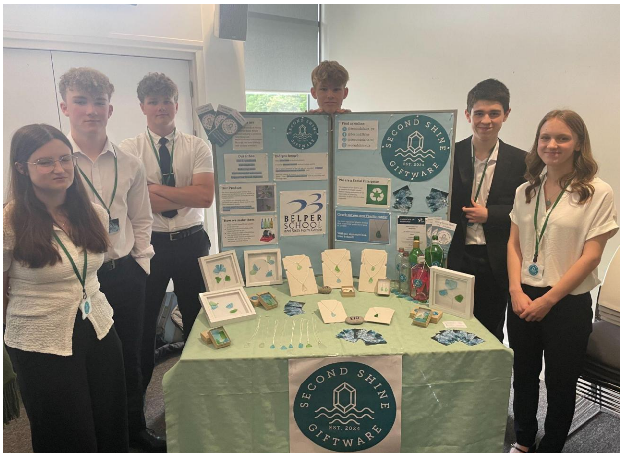
Second Shine's Trade Stall on display at the University of Warwick