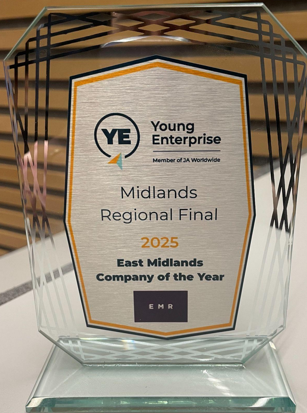
Our Company of the Year winners award!