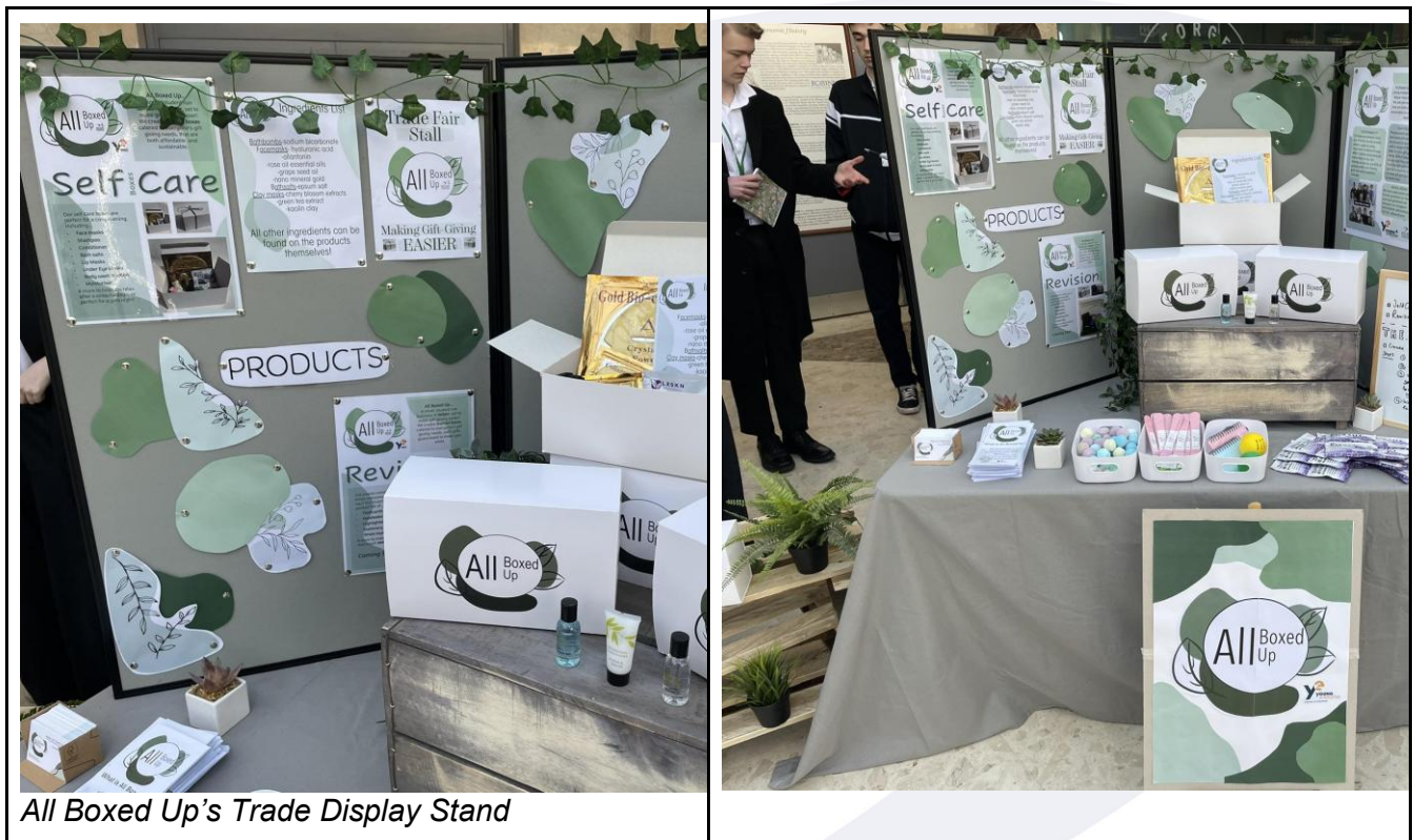
All Boxed Up's Trade Display Stand

After the conclusion of judging for the second successive year, we have a winner at Belper School for Best Trade Stand. "All Boxed Up" pipped our other team "Second Shine" to the award.