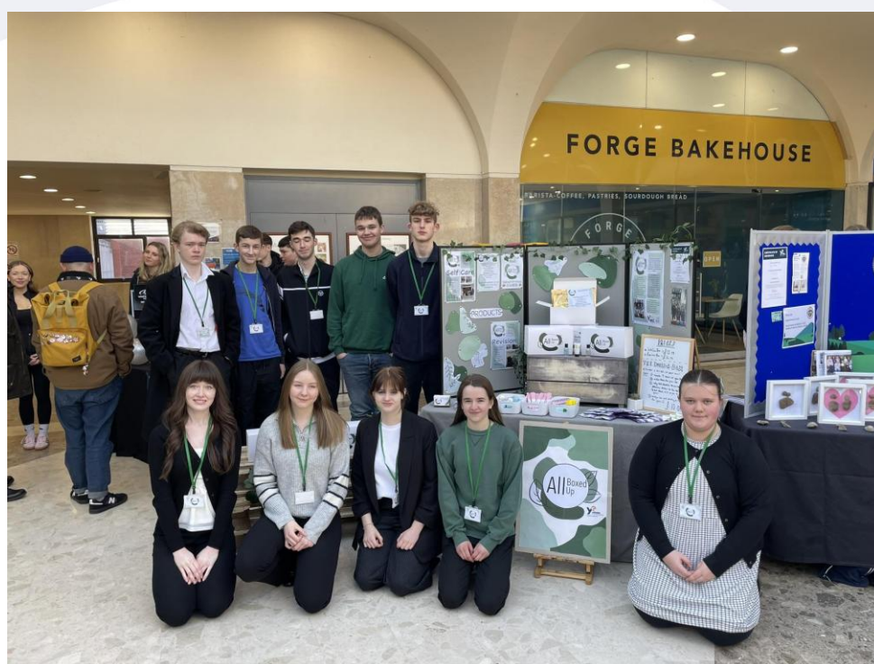
The Winners of the Derbyshire Trade Stand Award "All Boxed Up"